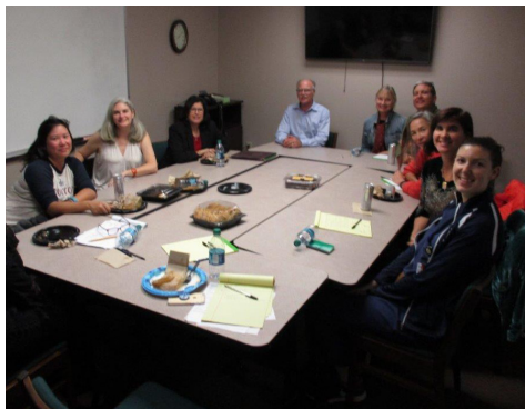
Immigration attorneys, forensic evaluators, and SURVIVORS' staff gather for an important conversation about serving asylum seekers in San Diego.

present their cases on their own. This meeting is an important opportunity to ensure we can continue to provide these critical services to our most vulnerable clients.