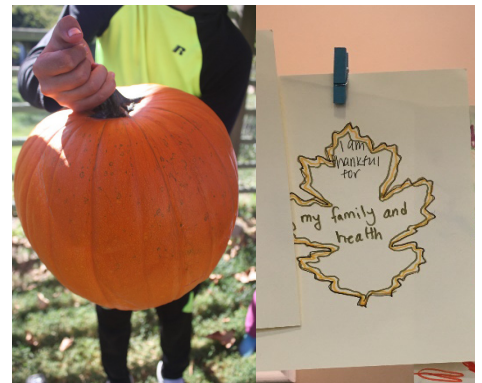
Left: Child from Syria holds his new pumpkin from the farm. Right: Family creates gratitude leaf for Thanksgiving tree.

Every November, SURVIVORS' clients, interpreters, volunteers, and staff gather for a Thanksgiving Healing Club. Volunteers and donors supply a delicious Thanksgiving feast for all to enjoy. Clients learn about Thanksgiving traditions in the United States and are encouraged to share their holiday traditions with the group. Following the meal, clients can participate in art projects such as creating a Tree of Gratitude