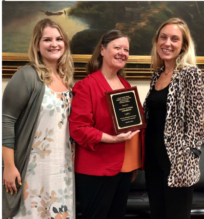
Staff proudly accepts the Advancing Principles Award on behalf of our agency and clients.