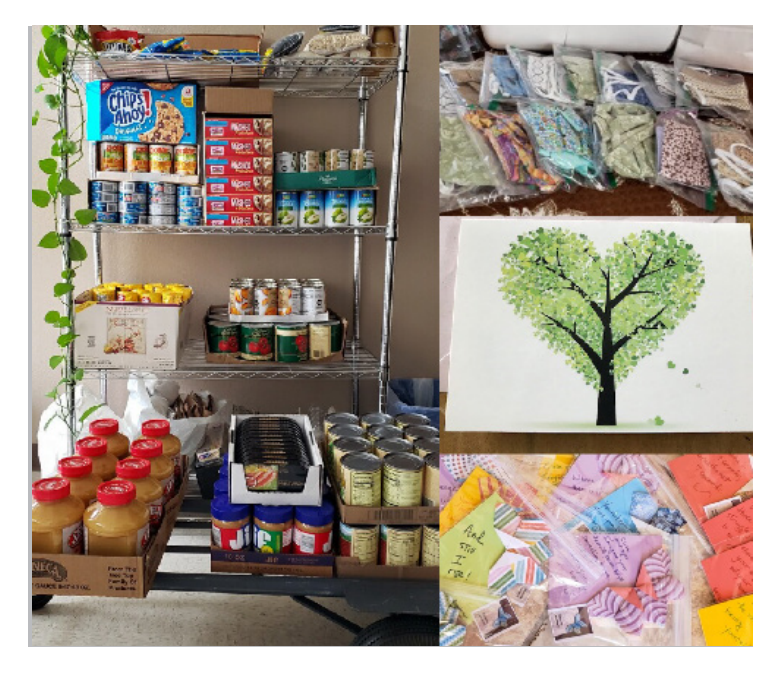
Survivors supported by volunteers with deliveries of groceries (left), hand sewn masks (top), meditation cards (middle), & cards of hope (bottom)

Our community of donors and volunteers is critical in our rapid response to clients' immediate needs. We appreciate their altruism in providing clients hope, genuine community, and reminders to remain grounded throughout this isolating and unstable time.