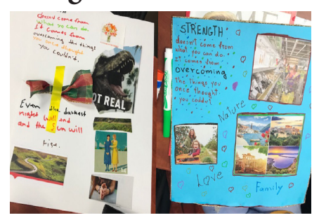
Vision boards created by two different clients who shared during Healing Club

One client shared, "I came here from Africa. I have a lot of dreams...The first thing I'd love to see